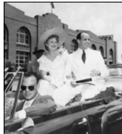
New Orleans Mayor Chep Morrison and wife

With the development of suburbs and new communities in New Orleans, as well as the burgeoning of television stations, the Fifties proved to be one of the city's most significant decades. Program highlights include the early days of local television; the career of New Orleans Mayor Chep Morrison, whose time in office spanned the decade; the development of the Lakeview and Pontchartrain Park neighborhoods; Canal Street as a regional shopping and entertainment mecca plus much more!