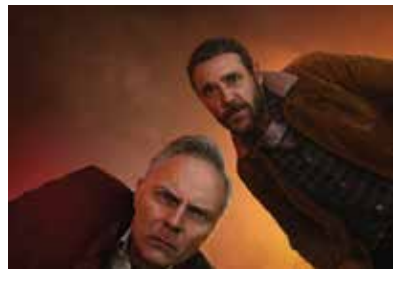
11pm MASTERPIECE "Guilt, Season 1" (Pt. 4/4) In this episode, with facts surrounding Walter's death increasingly in question, Max risks it all. *Season 2 premieres on Sunday, August 28 at 8pm. See how the dramedy continues with riveting plot twists and a strong vein of dark humor.

10pm BROADCHURCH (Pt. 8/8) After weeks of speculation, the events surrounding Danny Latimer's death are revealed. Shock waves ripple though Broadchurch as the community struggles to come to terms with the shocking news.