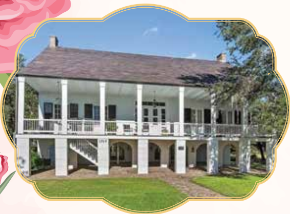
The home is listed on the National Register of Historic Places in St. Tammany Parish.